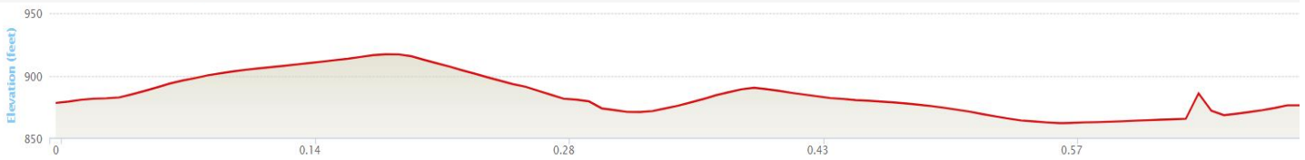
COURSE MAP 2 MapMyRide The course is 1.4 km, figure 8